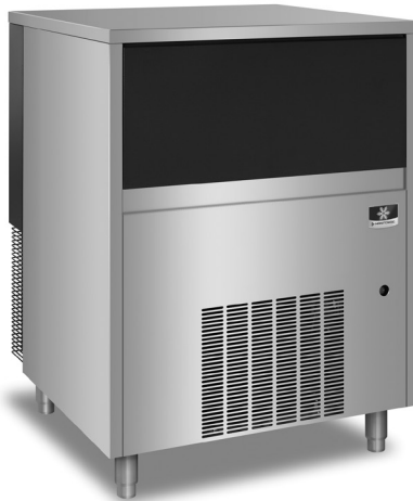
Model UNP0300A Nugget Ice Machine