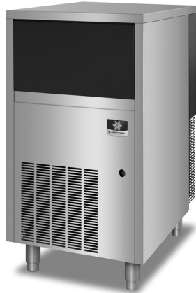
Model UNP0200A Nugget Ice Machine